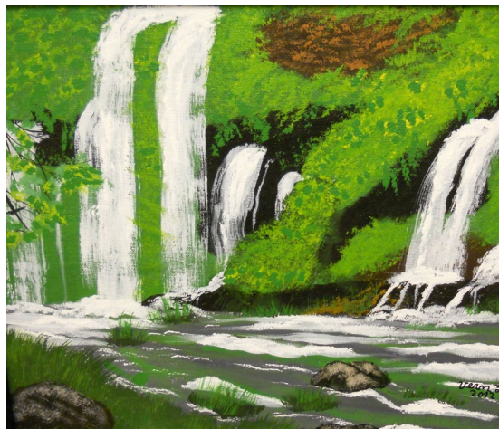
By: Vern F. Sanilac County

If you are being treated in a hospital, halfway house, or other live-in setting as part of your treatment for substance use disorder, you have some additional rights, such as the right to keep your own money and the right to know the rules about having visitors. These rights are included in the “Know Your Rights” brochure in your Welcome Packet.